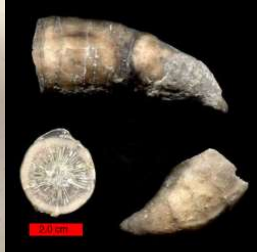
Horn Corals (found in clusters in several locations)