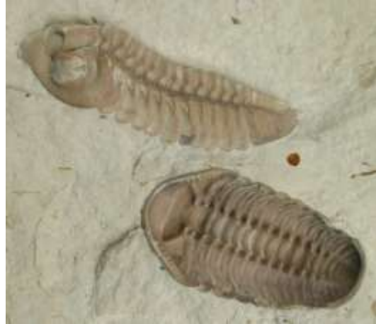
Trilobites (pieces of shed exoskeleton are often found)