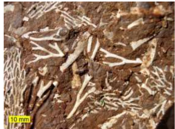
Bryozoans (“lace coral” – often seen as pieces of “stems”)