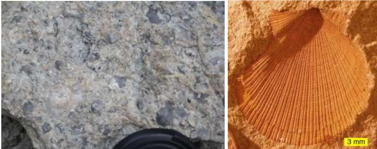
Bivalves (always two identical shells joined along a hinge line)