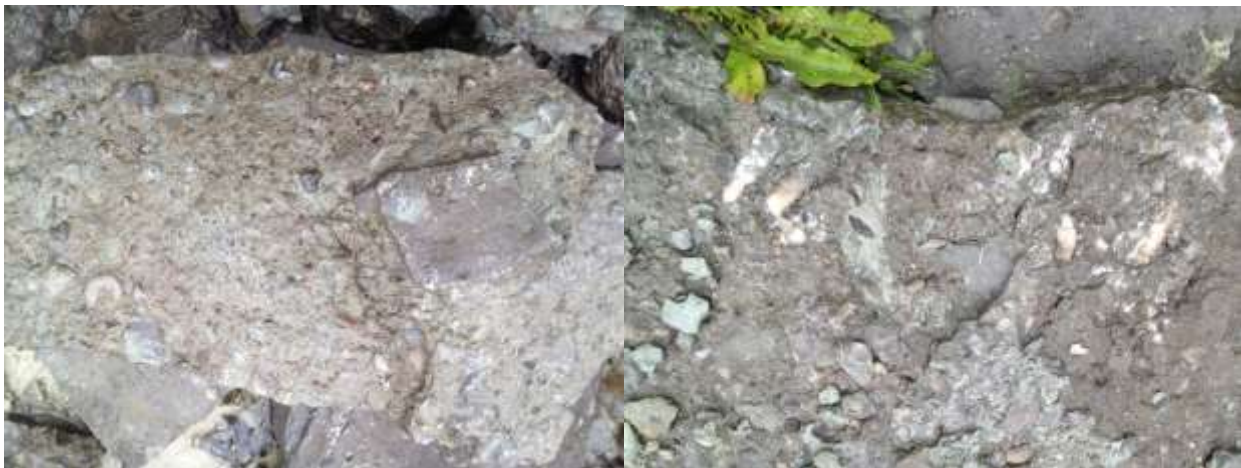
Limestone slabs with fossils, Caesar Creek State Park