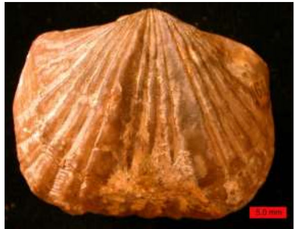
Brachiopods (“lamp shells” – have two uneven shells with beak)