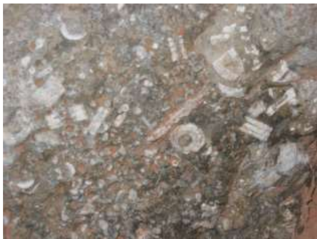
Crinoids (“sea lilies” – separated discs and columns are usually found)