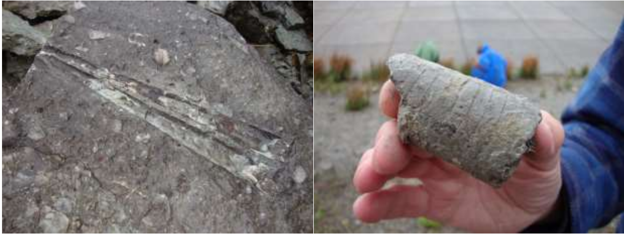
Cephalopods (squid-like straight-shelled nautiloids)