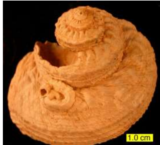
Gastropods (marine snails with single coiled shells)